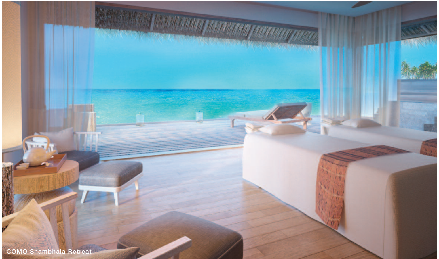
COMO Shambhala Retreat